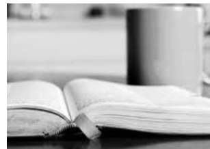
ADULT BIBLE STUDY MEETS ON SUNDAY MORNINGS AT 9:15 AM.

Ecclesiastes 1:2, 12-14; 2:18-23 Psalm 49:1-12 Colossians 3:1-11 Luke 12:13-21