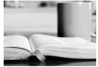
ADULT SUNDAY SCHOOL MEETS ON SUNDAY MORNINGS AT 9:15 AM.

There will no adult Sunday school class on Easter. The Animate: Practice series will continue on April 8. The final session in this series is April 29. Each lesson is self-contained so if you miss a class you can pick up where you left off. Join us in the lounge of Trinity Hall at 9:15 am.