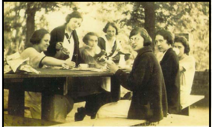
Church Girls Having a Picnic