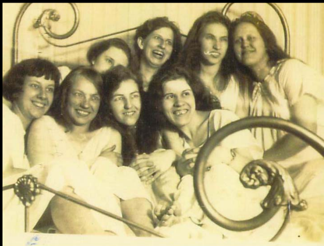
Church girls having a slumber party

This month, the theme of our photos is “oldies, but goodies”! Some are identified by activity & people, but not date.