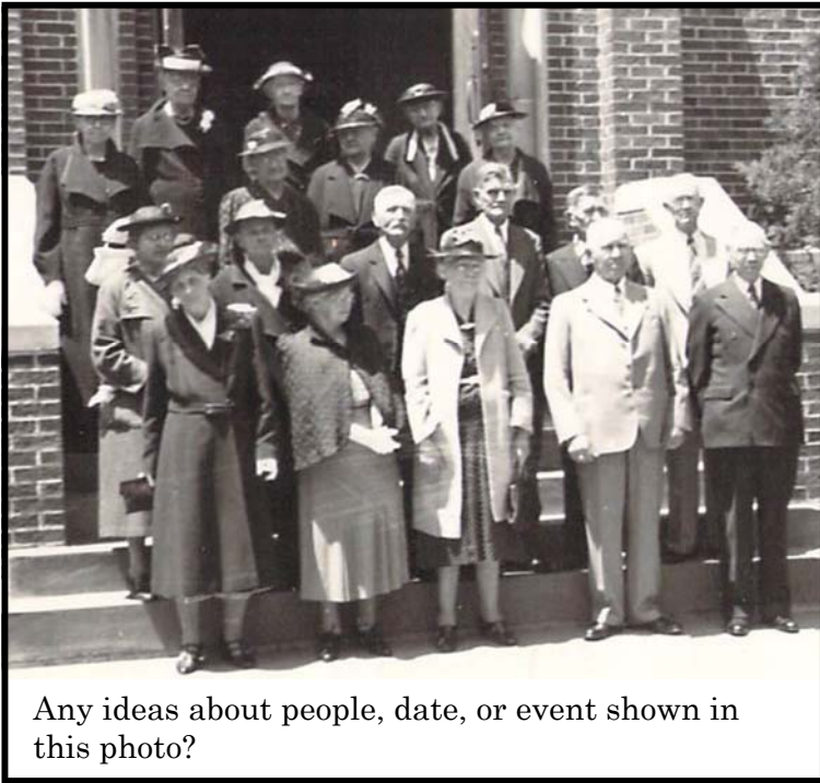
Any ideas about people, date, or event shown in this photo?