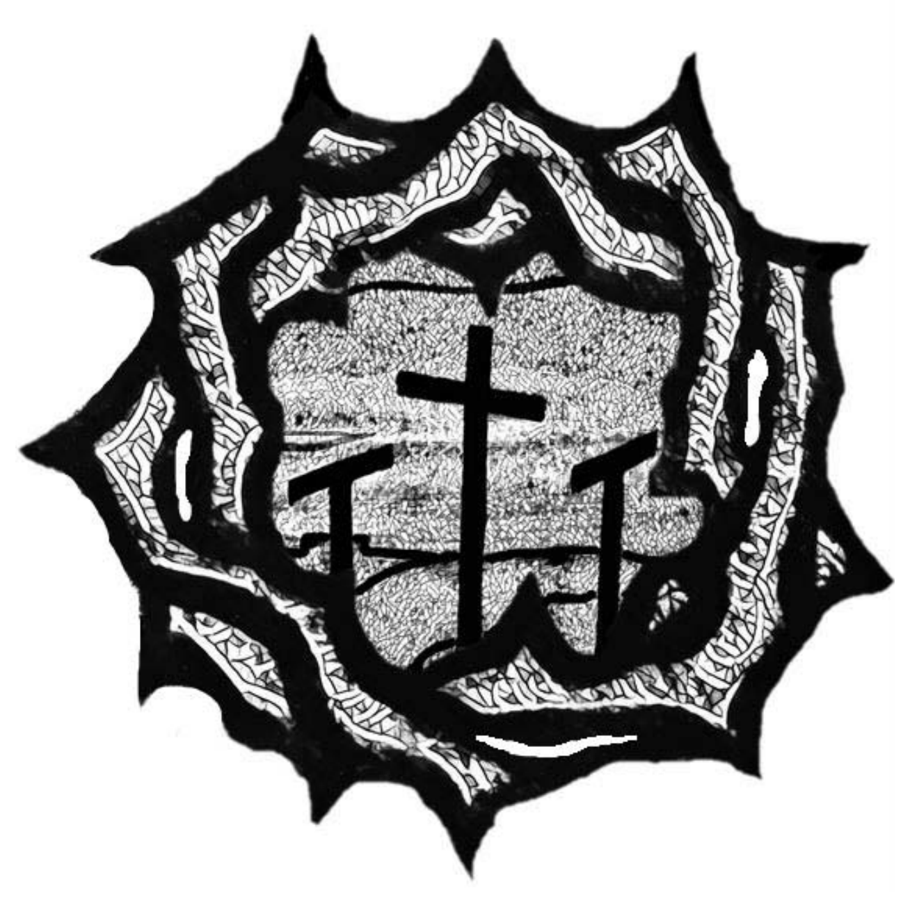
IST SUNDAY OF LENT MARCH 8, 2020