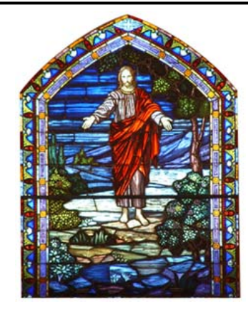
The mission of Trinity Evangelical Lutheran Church is to