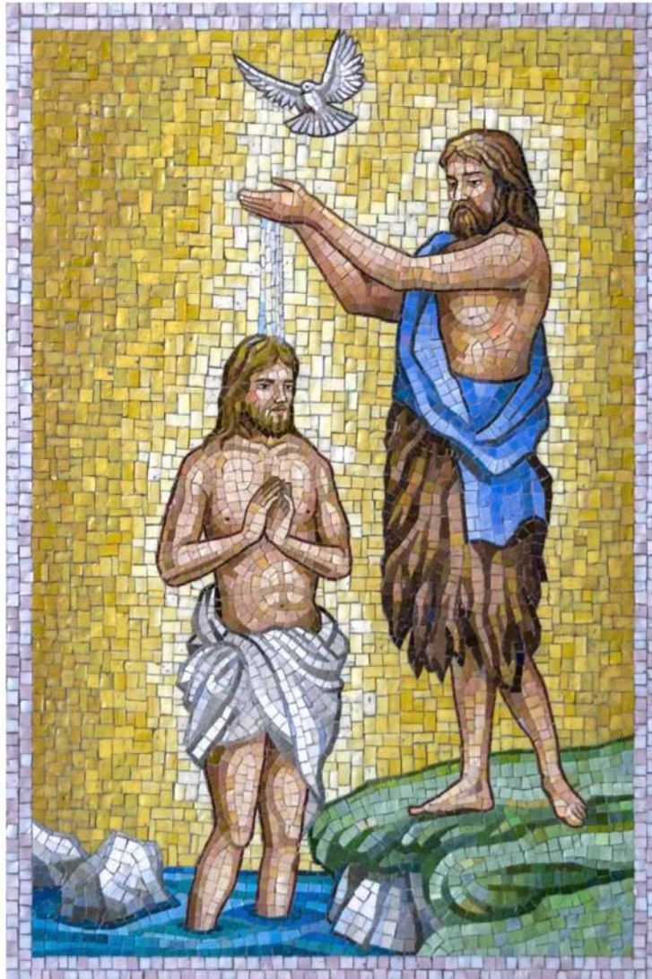
The Baptism of Everly Sue Bosch