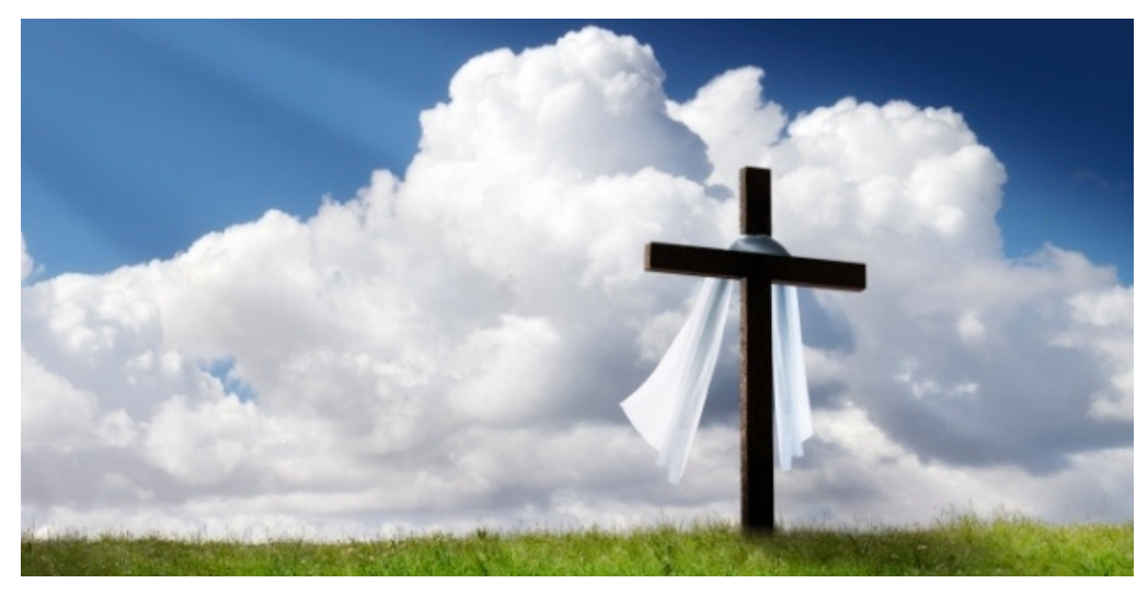
Surely goodness and mercy shall follow me all the days of my life, and I will dwell in the house of the LORD forever. Psalm 23:6