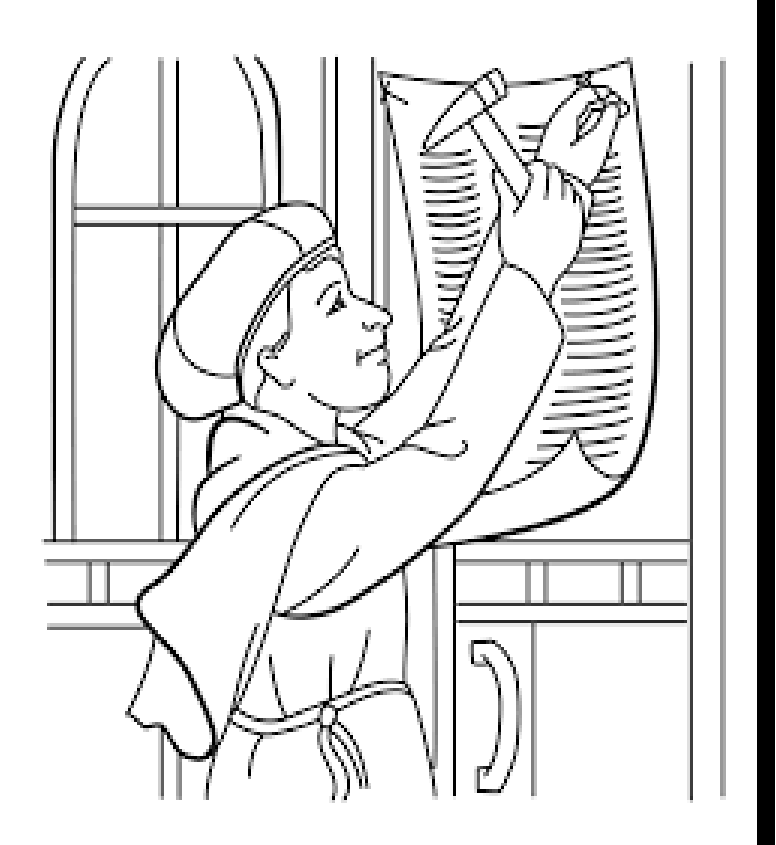
Color Martin and doors of the church