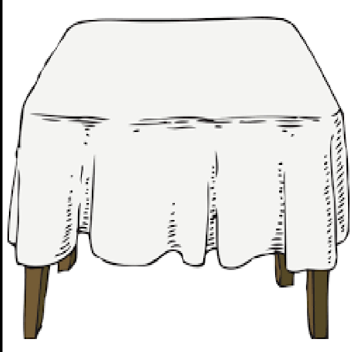
Draw the items we need for communion