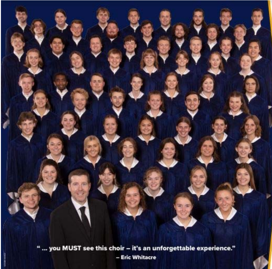
“... you MUST see this choir – it’s an unforgettable experience.” – Eric Whitacre