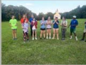
High School Retreat March 8th-10th