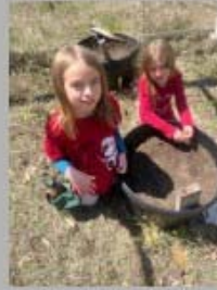
Taste of Camp Retreat April 21st