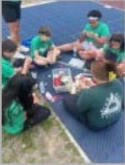
Middle School Retreat Feb. 23rd-25th