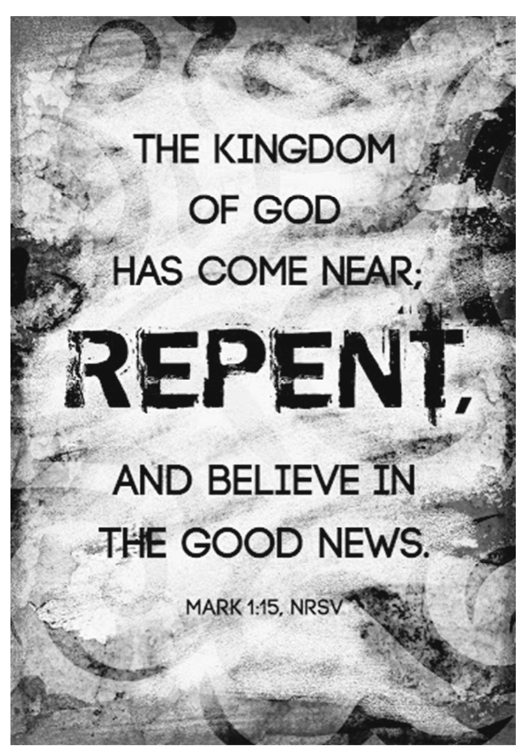
FIRST SUNDAY OF LENT