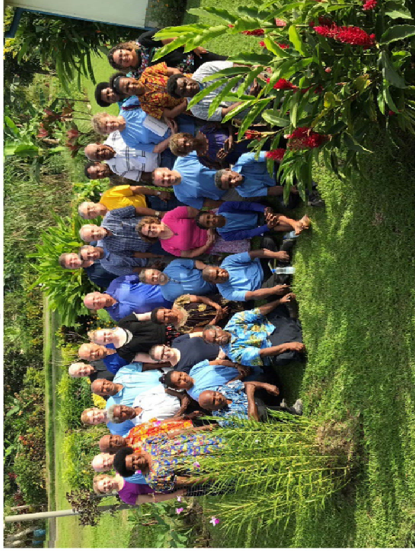
This is the group drawn from the Central States Synod and 3 other synods of the ELCA as well as well as the 4 companion districts of the ELCPNG who gathered for a consultation in 2019

A four-person delegation from the Central States Synod will be traveling to Papua New Guinea in August to participate in a consultation there and visit our companion district. However, there are no funds budgeted by the synod for this purpose. Can you help fund travel to this very important gathering in Papua New Guinea? The consultation will include representation from 3 other synods who have companion districts in PNG as well as representatives from the companion districts and the national church partnership offices of the ELCPNG and the ELCA.