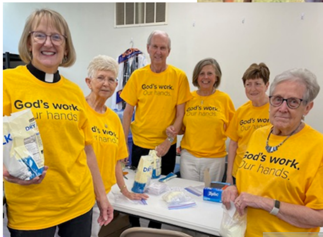
God's Work. Our Hands. Volunteer Day at Doorstep September 8.